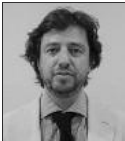
MIGUEL POIARES MADURO

Former Minister for Regional Development, Portugal